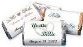
Personalized mini chocolates